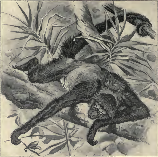
FIG. LXXXIV. ATELES VELLEROSUS. MEXICAN SPIDER MONKEY.